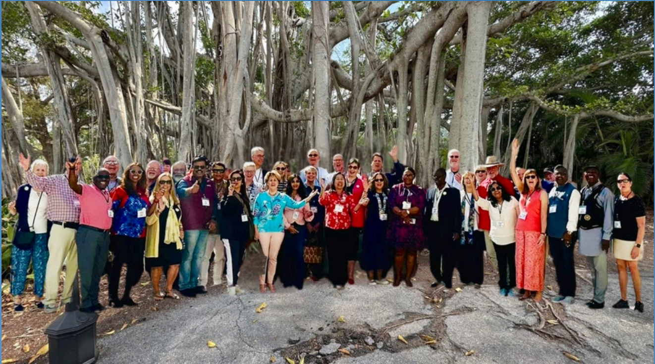
2025 Sarasota DGE HomeStay